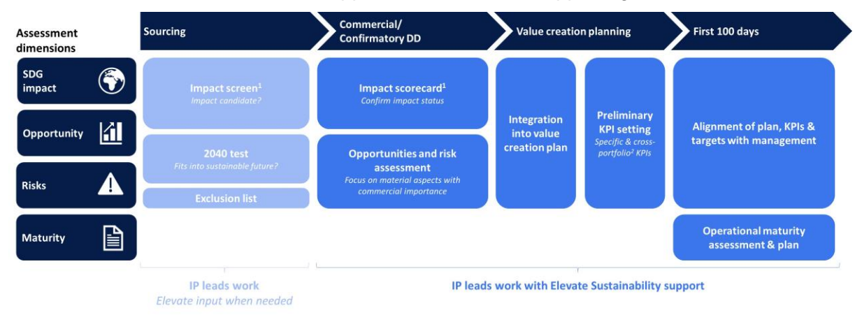
Figure 1 Overview of Verdane's sustainability assessment process

Evaluating sustainability is a key and integrated part of Verdane's sourcing and evaluation of investments. It follows a structured approach with several supporting tools.